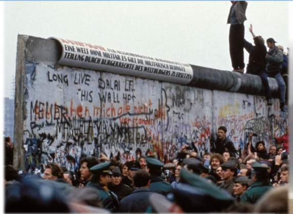
Berlin wall being torn down in 1992.

We don't have to look far to see that there is no lasting peace in this world and there never will be until people have peace in their hearts.